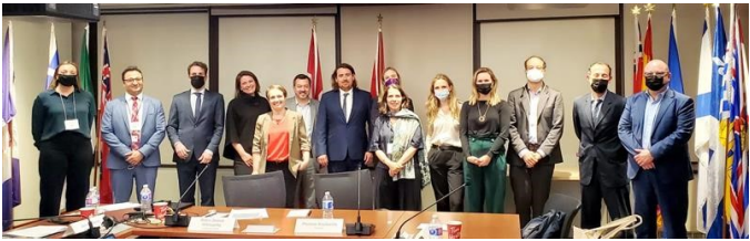
State representatives from Argentina, Australia, Belgium, Brazil, Canada, Portugal, the United Kingdom, and members of the University of Ottawa Refugee Hub pose for a group photo.